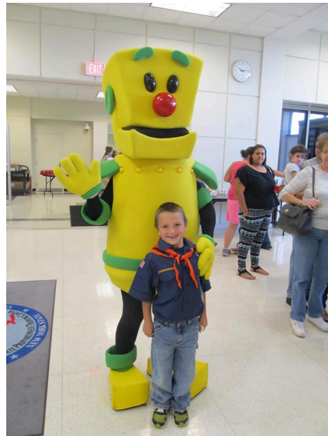
Clicky the Robot met with Scouts at RTC's Emergency Preparedness Event on Sept. 27. Click here to see the event gallery.