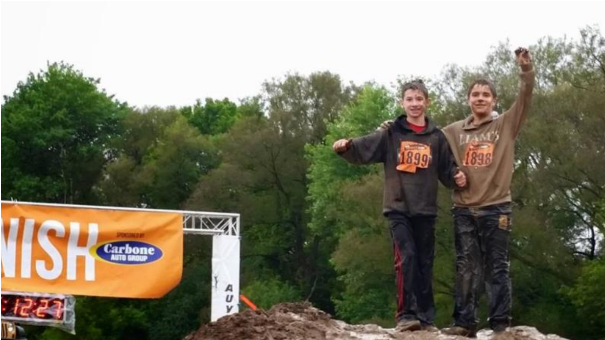
Scouts celebrate finishing the Mighty Run at the Boy Scout Camporee in September.